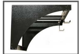
Wall Bracket (Standard)