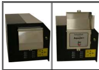
Anti-Tamper Security Cover